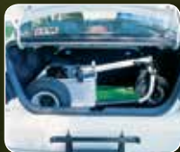
Tucked away in the car. Even a small one!