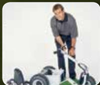
Remove batteries & hinge down the tiller