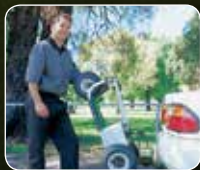
Lift onto car