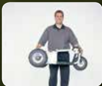
Lift vehicle into boot with ease