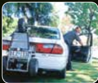
And off you go!